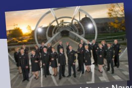
The United States Navy 'Sea Chanters'

Wednesdays, Fridays and Sundays at 7:30 p.m.