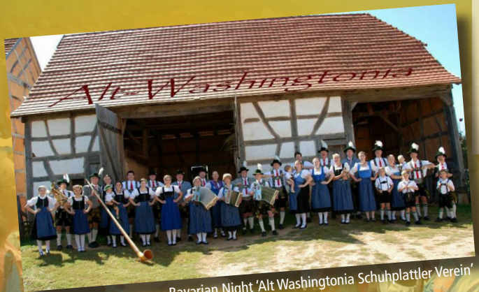
Bavarian Night 'Alt Washingtonia Schuhplattler Verein'

Spotlight by Starlight is presented in partnership with many friends of Mason District Park and generous contributions from the following sponsors: