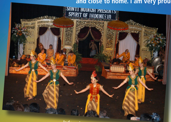
Indonesian Cultural Heritage Night 'Santi Budaya'